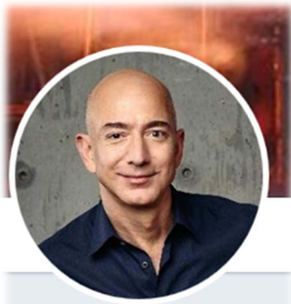
Jeff Bezos ✓